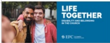
Life Together: Disability and Belonging in the Church

This 56-page booklet contains articles and discussion questions that can help you and the Christians around you understand the importance of including people with disabilities in church communities, what ableism is and why it matters, and how we can respond to current shortcomings and injustices.